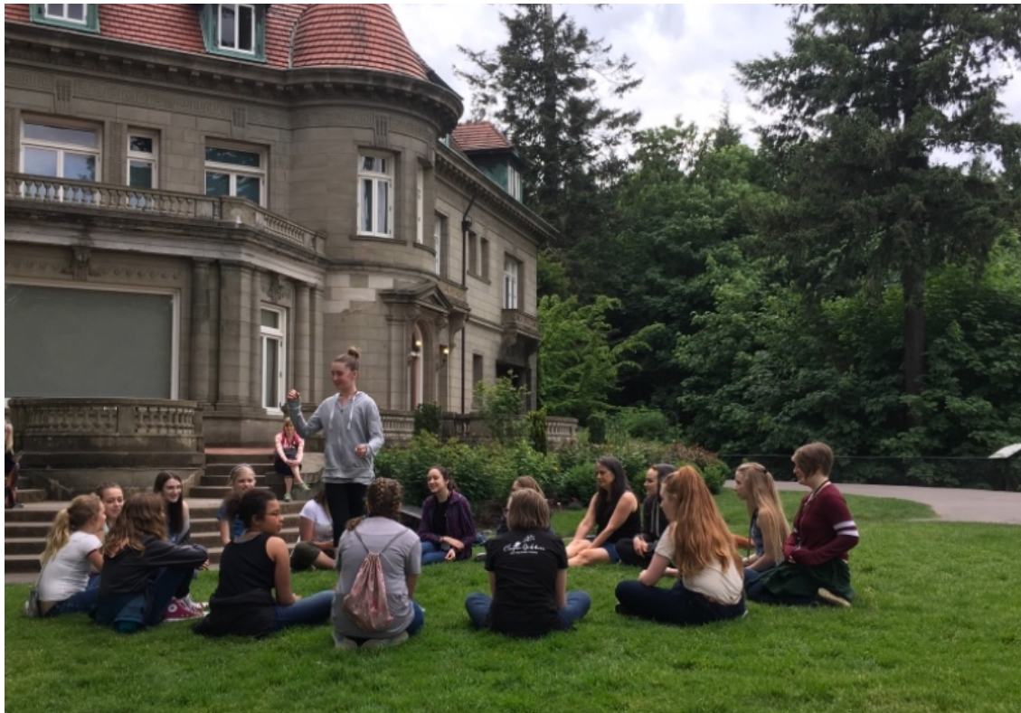
Oregon Girlchoir enjoyed singing and playing games in the gardens of Pittock Mansion during their Spring Trip to Portland.

Check our website for details: www.oregonchildrenschoir.com